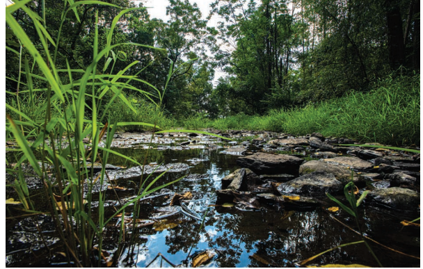
Willoughby's Run witnessed some of the Gettysburg battle's earliest and most striking opening moments.

Which makes you wonder — what will those ghosts be thinking of us if we allow a sprawling apartment complex to be built here, on land stained by blood and consecrated by honor?