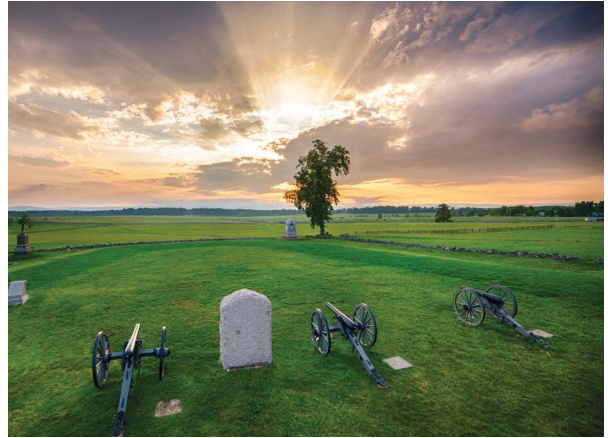
Help save hallowed ground at Gettysburg.

But there is only so much land, and there is only one Gettysburg. Which is why, when we saw the plans for a sprawling apartment complex that was going to be built right smack-dab at Willoughby's Run, we did the only thing we could. We saved the land.