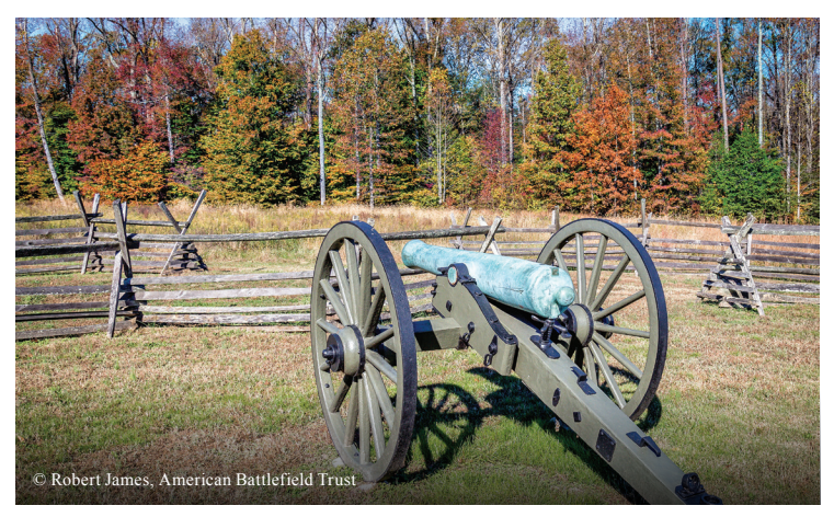
The battle at Gaines' Mill witnessed over 15,000 combined casualties in six hours of fighting, and ended with Lee's first victory as commander of the Army of Northern Virginia.

For two decades, we kept up our dogged pursuit.